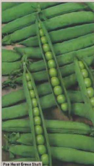
Pea Hurst Green Shaft

* NIAB HURST GREEN SHAFT Borne in pairs, the pods are about 11cm (4½") long and carry from 9-11 delicious, sweetly flavoured peas. Reliably produces heavy crops and is highly disease resistant. Ht. 60-75cm (2-2½'). AGM. 400 seeds. 43 02 38 £1.30