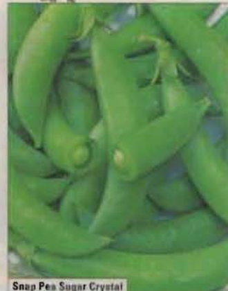
Snap Pea Sugar Crystal

SUGAR CRYSTAL The first semi-leafless Snap Pea, this high yielding variety can produce 2 pods per node and 7-8 delicious peas per pod. Can be planted from June-July onwards as it is resistant to Powdery Mildew and Fusarium. Ht. 90-120cm (3-4'). 450 seeds. 43 06 53 £2.05