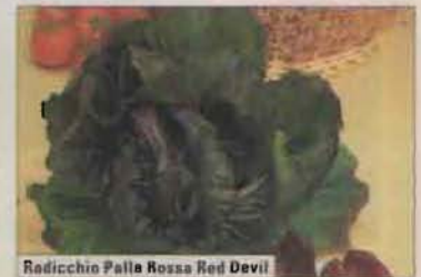
Radicchio Palla Rossa Red Devil

PALLA ROSSA RED DEVIL A superb selection of this versatile vegetable. An ideal addition to autumn salads, the large red heads produce colourful leaves with attractive white veining and a distinctive taste. Best sown late June-July for Sept-Nov harvesting. Red Devil will withstand early frosts. Row 4.5m (15'). 450 seeds. 43 82 66 £1.15