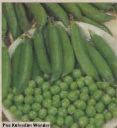
Pea Kelvedon Wonder

FORTUNE This superb variety boasts reliable yields and excellent quality. Superb for overwintering or spring cropping. Ht. 45-60cm (1½-2'). 350 seeds. 43 02 54 £1.40