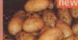
JULIETTE - Modern high yielding variety with great flavour and good disease resistance.