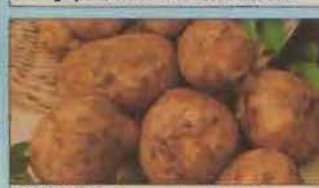
MARIS BARD - Ever popular; high yields; good for early lifting.