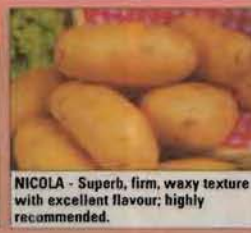
NICOLA - Superb, firm, waxy texture with excellent flavour; highly recommended.