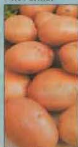
VANESSA - Superb flavour, high yields; also excellent for salads.