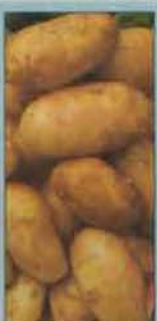
SWIFT - The ultimate early first early; waxy flesh with delicious flavour.