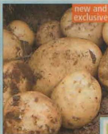
RIVIERA - A multipurpose first early; large tubers with good virus resistance.