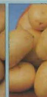
WINSTON - Excellent scraper when lifted early; good for baking at full maturity.