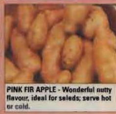
PINK FIR APPLE - Wonderful nutty flavour, ideal for salads; serve hot or cold.