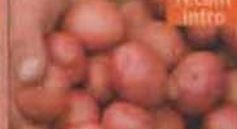
MIMI - Good yields of potatoes with an excellent flavour; suitable for growing in tubs and containers.