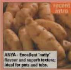
ANYA - Excellent 'nutty' flavour and superb texture; ideal for pots and tubs.