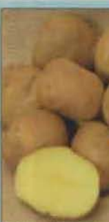
LADY CHRISTL - High yielding with a great new potato flavour; RHS Award of Garden Merit.