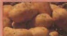
CHARLOTTE - Early maturing, superb strong flavour, firm waxy texture; easy to grow, good cropping, use with hot or cold.