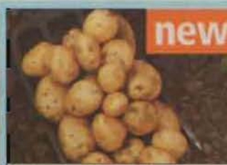
ACCENT - Very early variety with good flavour and high yield; Eelworm and scab resistant.